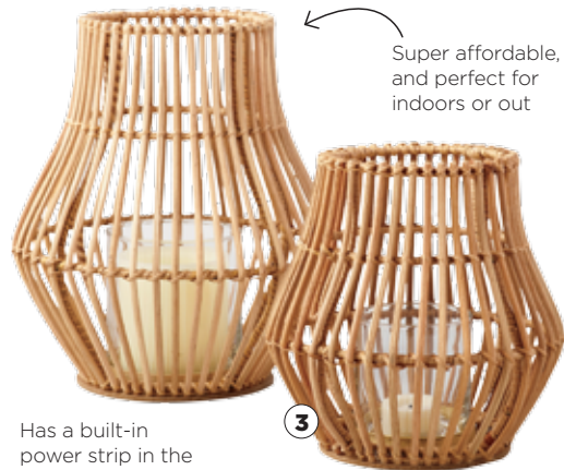
Super affordable, and perfect for indoors or out