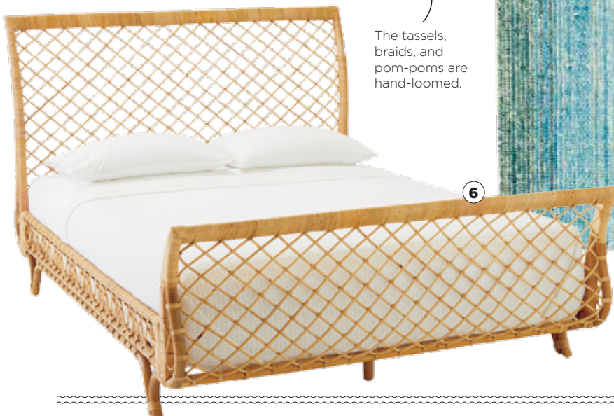
The tassels, braids, and pom-poms are hand-loomed.