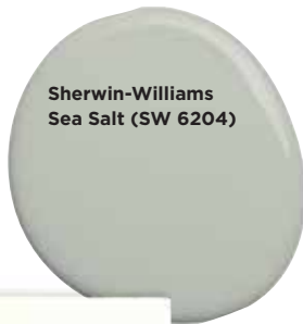
Sherwin-Williams Sea Salt (SW 6204)