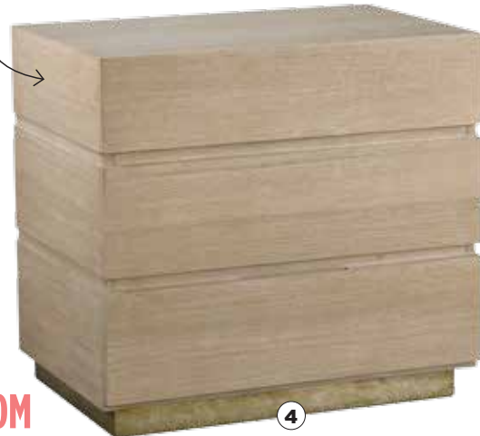
Has a built-in power strip in the top drawer.